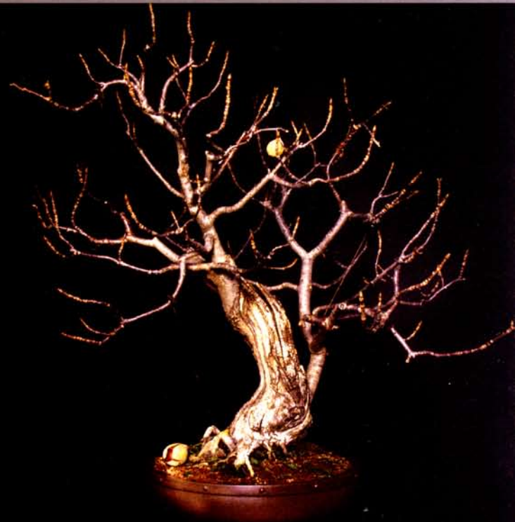
Top Left: Chinese Elm Forest; David Stern